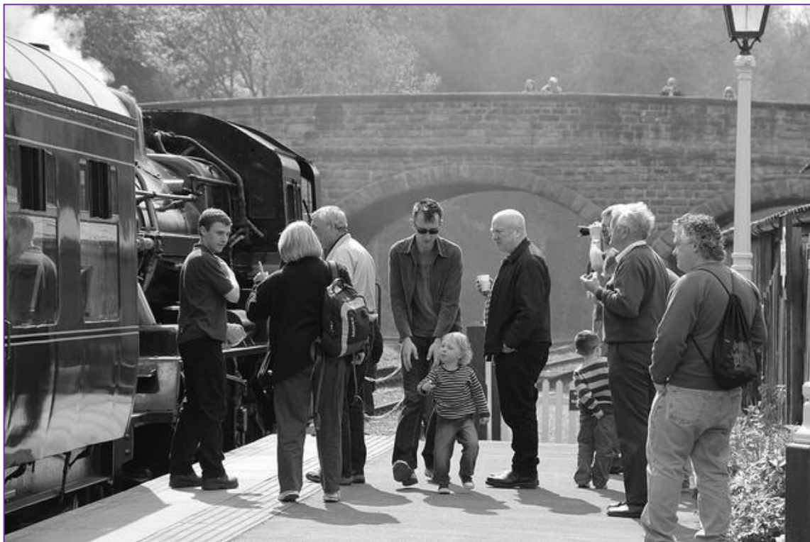
An atmospheric shot of one of our visiting steam locomotives at Wirksworth