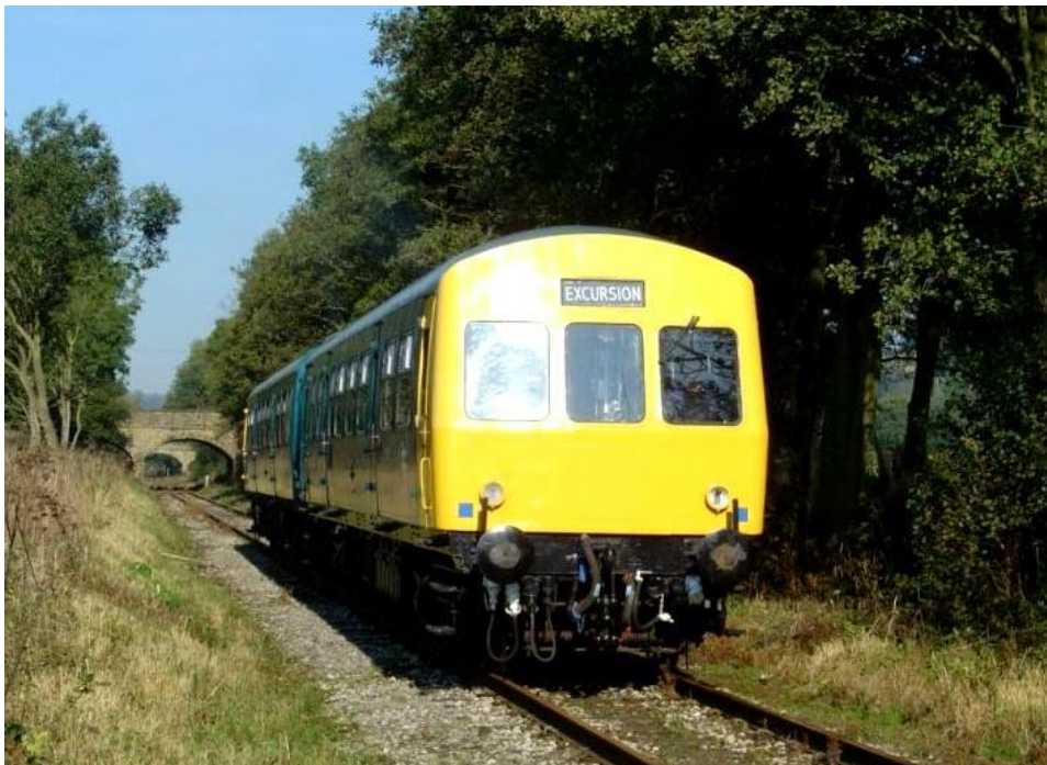
The line at Callow Park with a train bound for Duffield

The 2018-2019 year has been primarily devoted to improvement works of various kinds around the station at Duffield, not only those in conjunction with the Derwent Valley Line Community Rail Partnership (DVLCRP), but also in conjunction with Network Rail and East Midlands Trains. A major expenditure of the Trust this year was the provision of an electronic till system for the Duffield Station booking hall. This system now enables us to print tickets and sell goods and refreshments much more quickly than the manual system which it replaced.