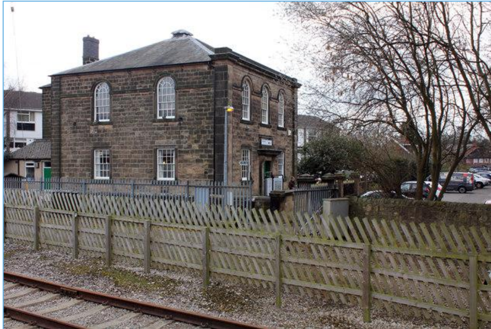
The entrance gate to Duffield Station from Chapel Street

The 2017-2018 year, therefore, has been primarily devoted to improvement works of various kinds around Duffield Station not only those in conjunction with the Derwent Valley Line Community Rail Partnership (DVLGRP), but also in conjunction with Network Rail and Western Power to relocate the electrical supply to the station. This latter is a key step towards a goal of reconstructing the entrance to our car park and the EVR line platform at Duffield from Chapel Street. This particular project is on-going and will not only improve the approach to our station but will assist residents and neighbours on Chapel Street in general.