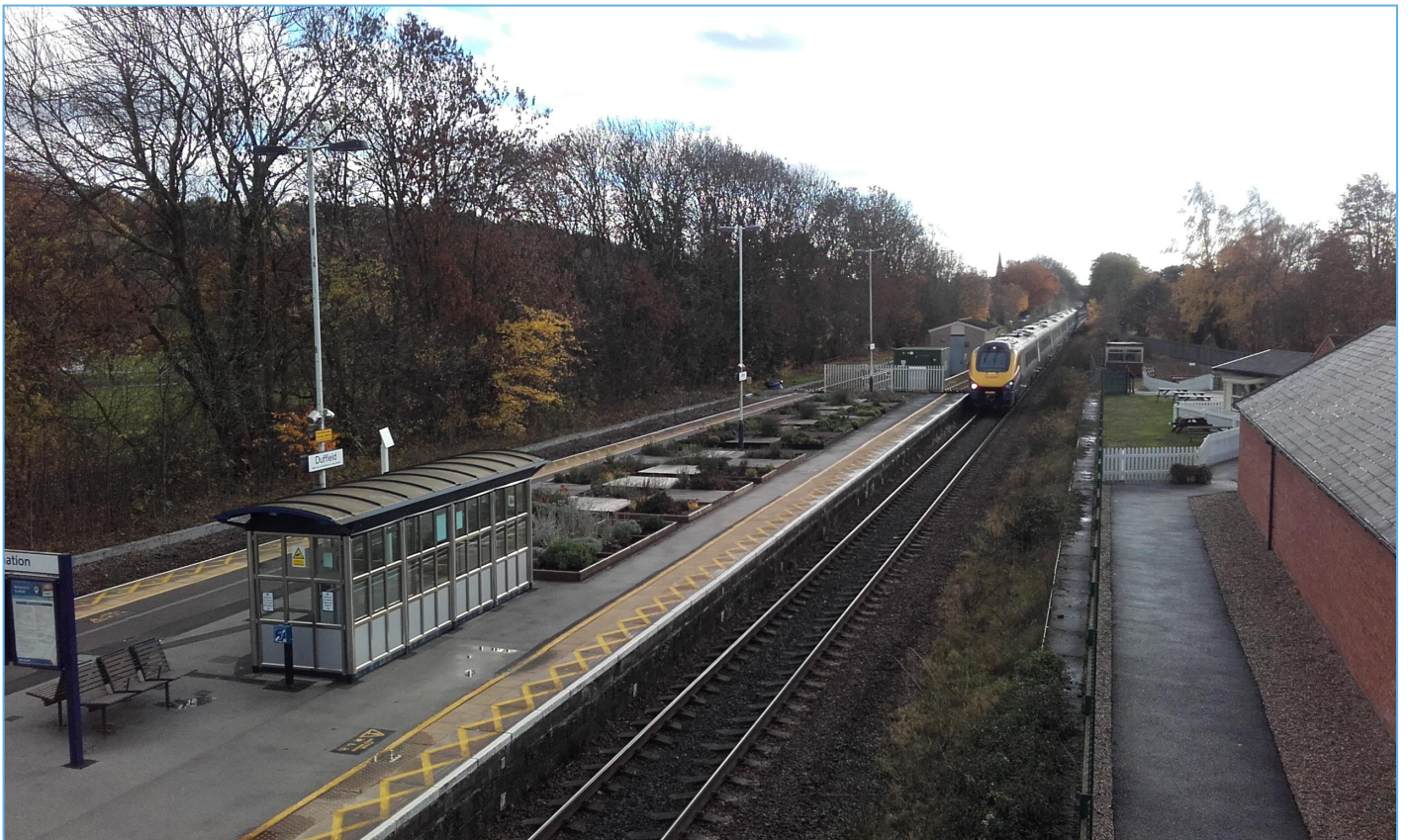
The completed gardens and decking area at Duffield showing an approaching main line service.

The trust has had a productive year since our last annual review. I noted in that report that our key effort was to address the improvement of Duffield Station. Volunteers at Duffield, working together with the Friends of the Derwent Valley Line and East Midlands Trains, put considerable effort into making our main line connection station much more presentable to visitors to our railway arriving there. This was achieved by providing decking and garden planting to improve the look of the station in general.