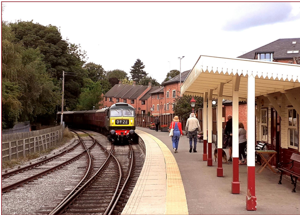
The 11.29 arrival from Wirksworth on the 10 th May 2021

In 2019 and 2020, the Trust's officers had been engaged in discussion with the planning authority to provide the new gated entrance to Duffield Station from the end of Chapel Street. This process has been considerably slowed by the Coronavirus epidemic and whilst we had hoped the gates would have been completed in this financial year, this will not be the case. However, it