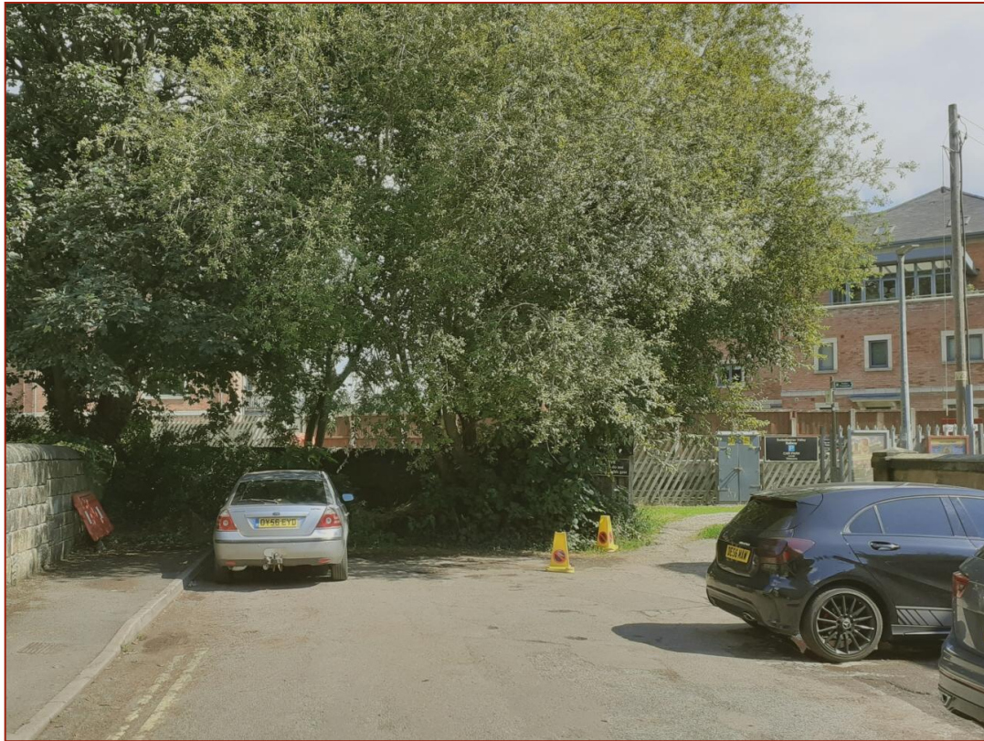
The current Chapel Street entrance

was important to begin the process, which is not without costs, in order to make the entrance to the EVR Duffield Station more presentable and safer to use. After many delays, planning permission was finally granted for the entrance in January 2021 but for a different design of gates than had been envisaged. This has resulted in a re-work of the design and by the end of the Trust's year Milwards have been approached to undertake the work.