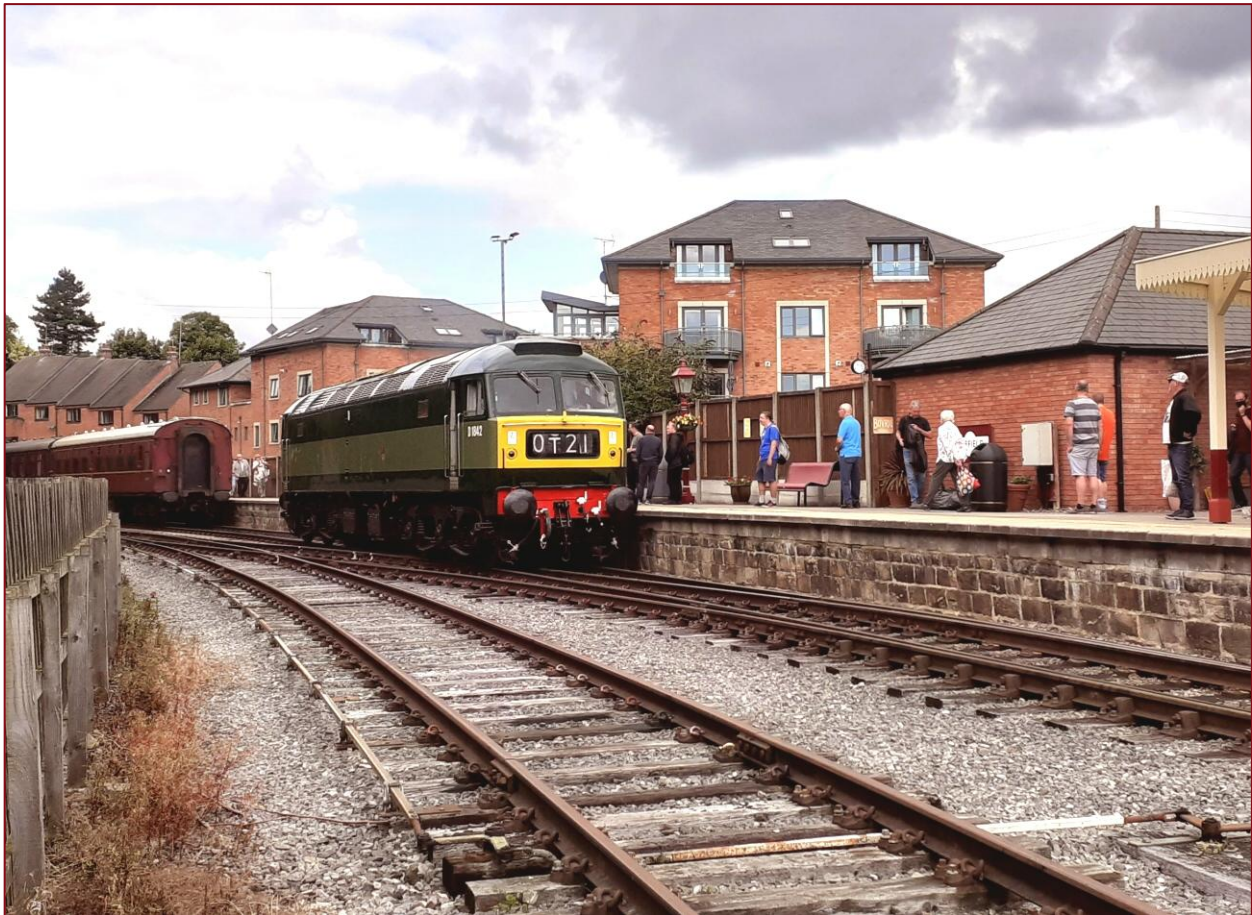
Class 47 Locomotive D1842 running around its train at Duffield

The Trust has limited resources and this being the case, it is normally the policy of the Trust to only take on any new project once an existing project has been finished, it is not our policy to operate with an encumbrance of unfinished activities.