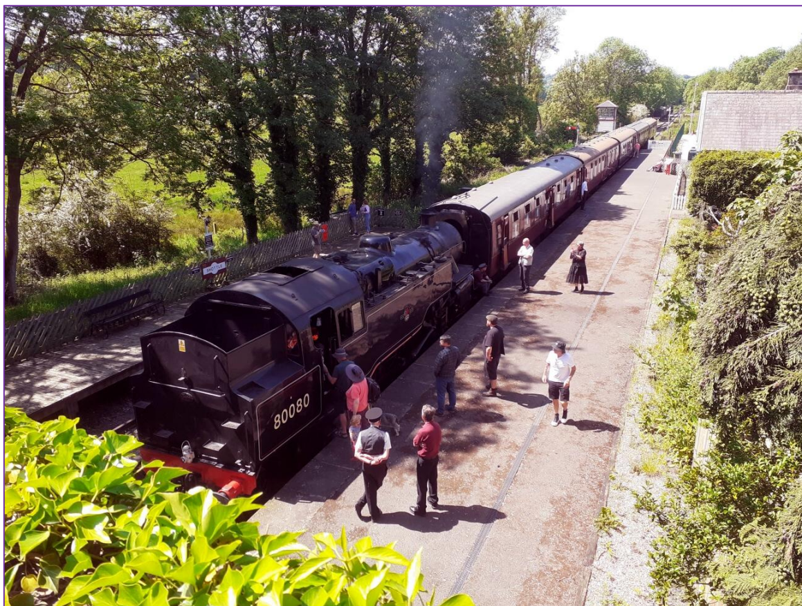
Shottle Station on the 27 th May 2024

The Trust has, over a period of years, been renewing the signage, interpretation and poster boards at a number of our stations to comply with a standard laid down by the Wyvernrail Board many years ago.