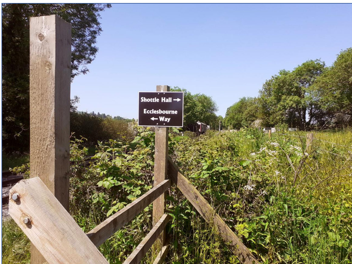
New signage paid for by the Trust around Shottle Station