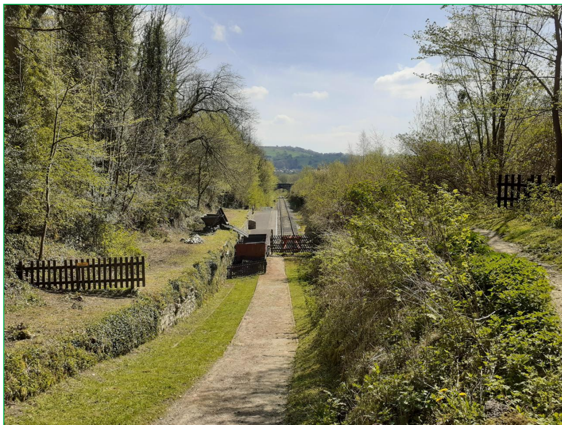
Ravenstor Station looking south in 2022