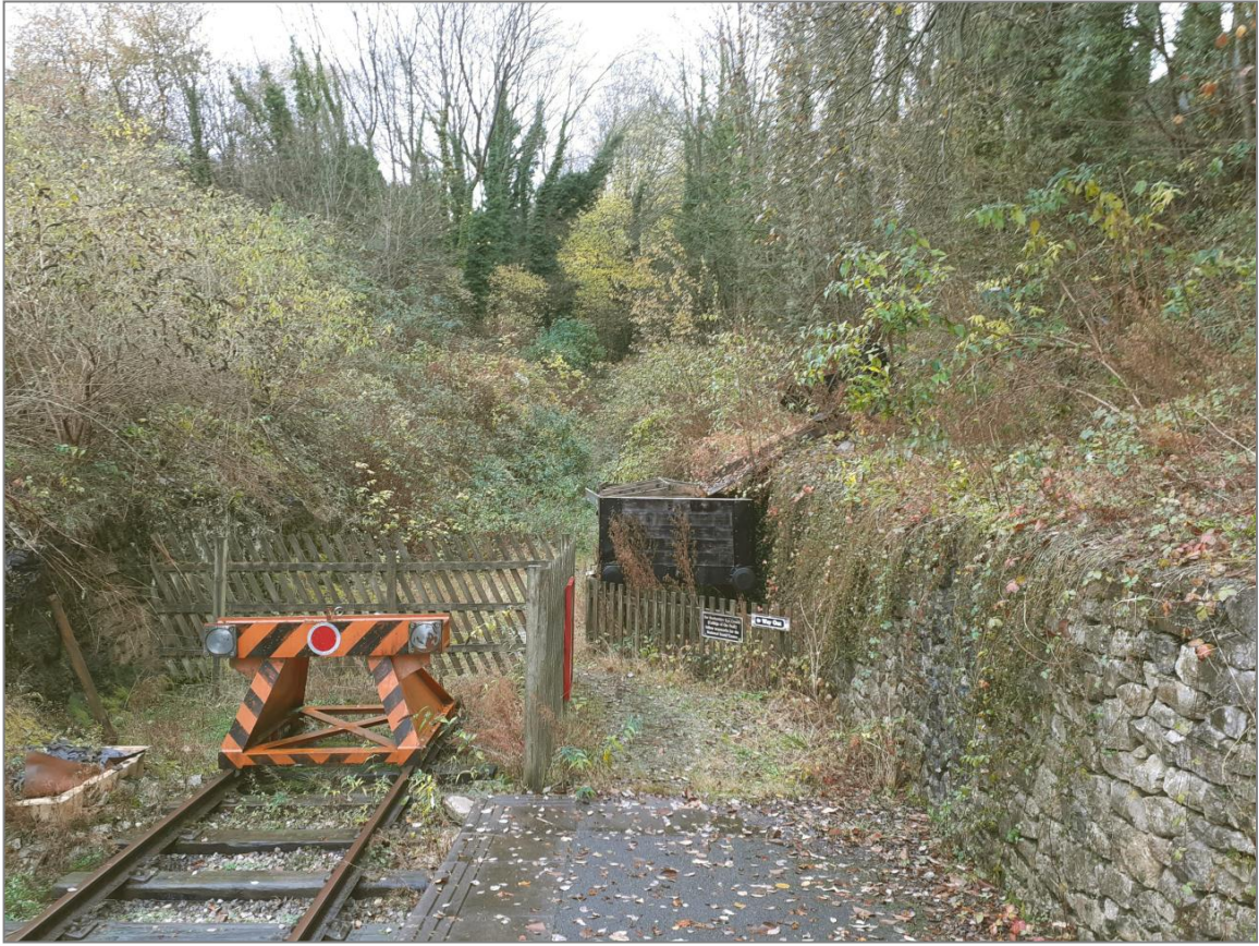
Ravenstor Station looking north in 2020