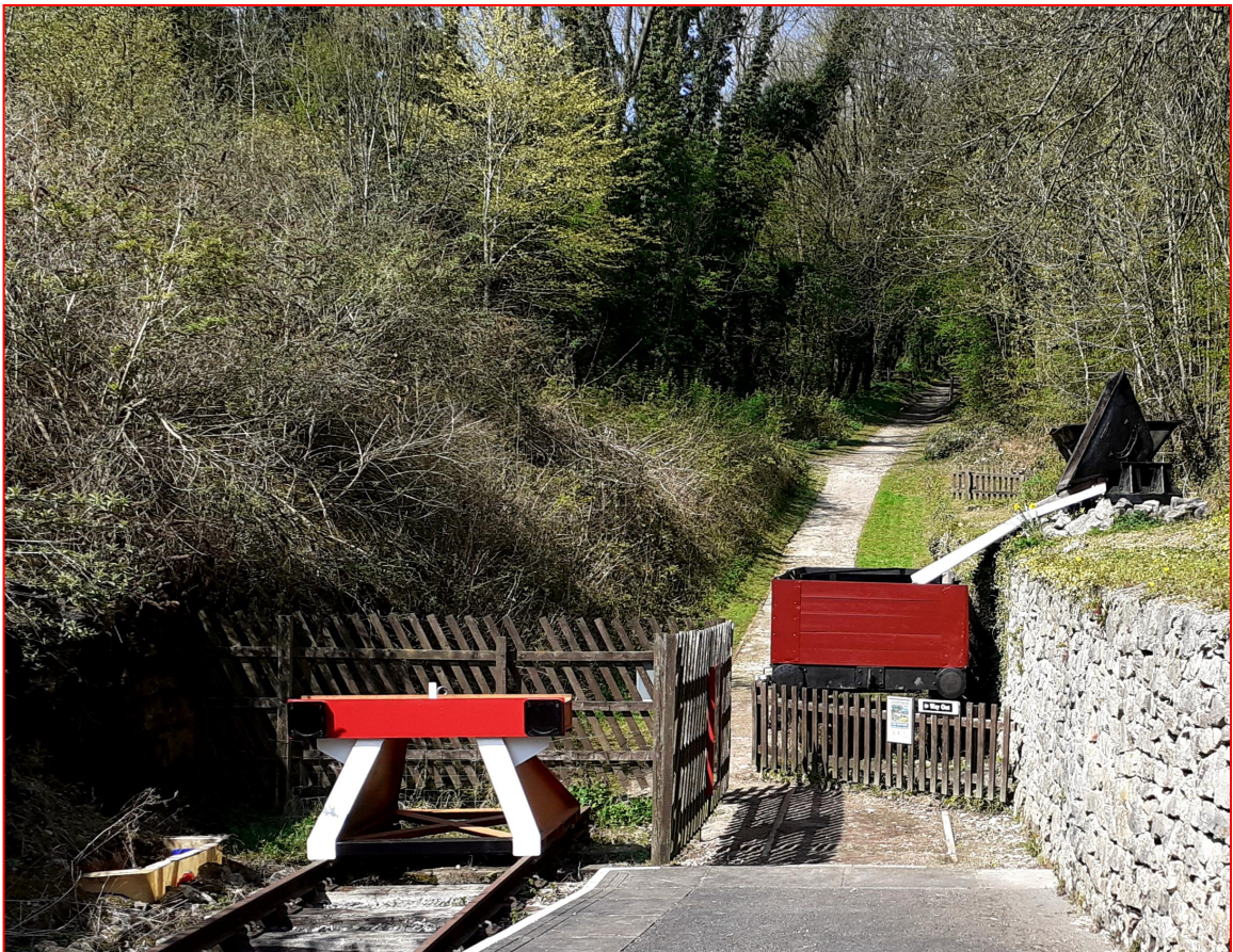
Ravenstor Station looking north in 2022