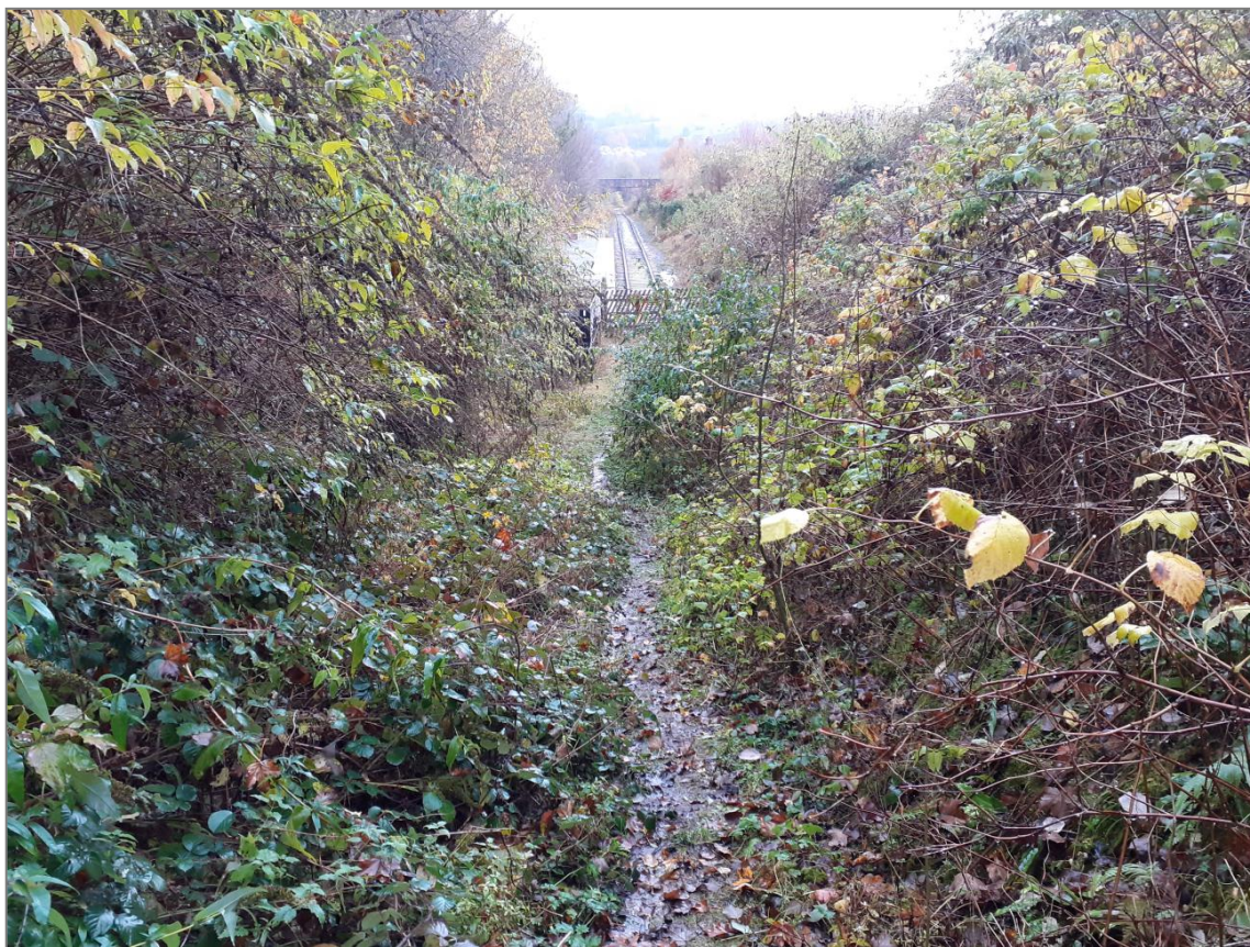
Ravenstor Station looking south in 2020

and Quarry Walk during the summer of 2022. This activity will complete the restoration of the historic and interpretative features which were constructed when Ravenstor Station was opened in 2005, some of which were in a derelict state, with access being unsafe for the public.