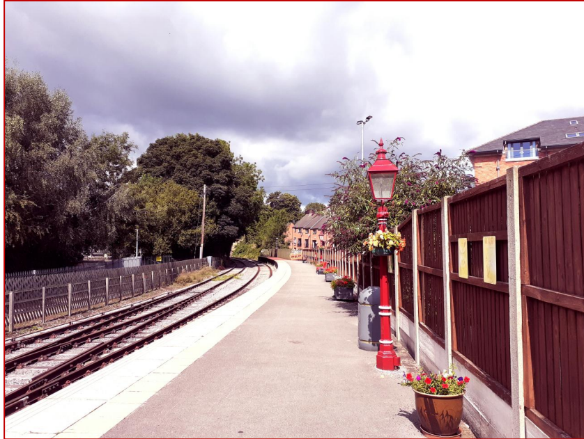
Duffield Station looking towards Wirksworth

After some delay, planning permission for application 2020 0279 was finally granted (to Wyvernrail Plc) for the entrance on the 5 th March 2021 but for a different design of gates than had been envisaged. This has resulted in a re-work of the design and by the end of the Trust's year Milwards had been approached to undertake the work and the project is being taken forward by Wyvernrail with £4,000 committed funding from the Trust towards it.