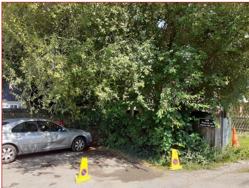
Chapel Street: location of the proposed new gate

For some time the Trust's officers had been engaged in discussion with the planning authority to provide the new gated entrance to Duffield Station from the end of Chapel Street. This process had been considerably slowed by the Coronavirus epidemic. However, it was important to move the scheme forward, which was not without costs, in order to make the entrance to Duffield EVR Station more presentable and safer to use.